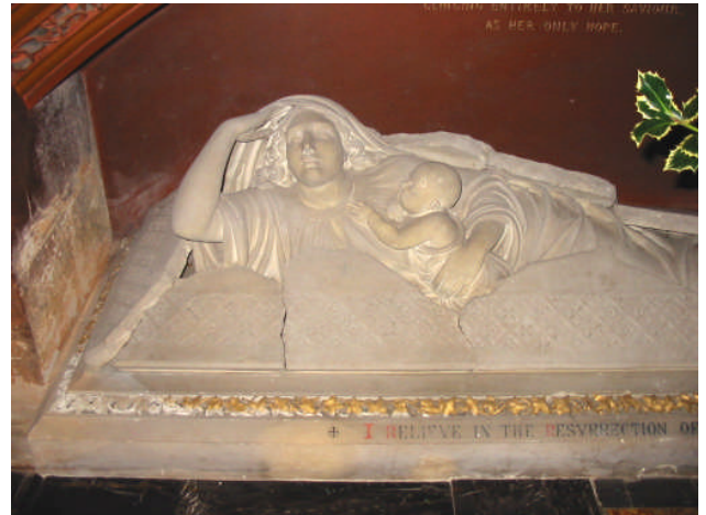
woman rising from the grave