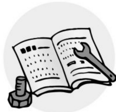
instructions for living